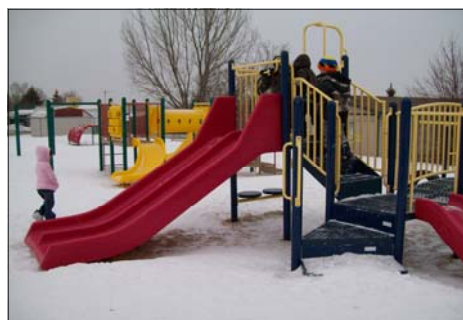
Our Program added a new piece of play

equipment and surfacing to the play area this year with program improvement funds ($35,000) and have also received approval to remove the existing storage shed and build a larger one in the same area ($32,000).